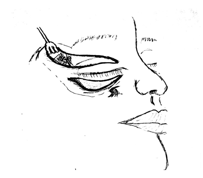
Fig. 3. The orbicularis muscle and the soft tissue from the mid-face are suspended to the periosteum of the upper-lateral orbital rim.

Fig. 2. Canthopexy is performed to tighten the lateral canthus to the upper orbital rim.