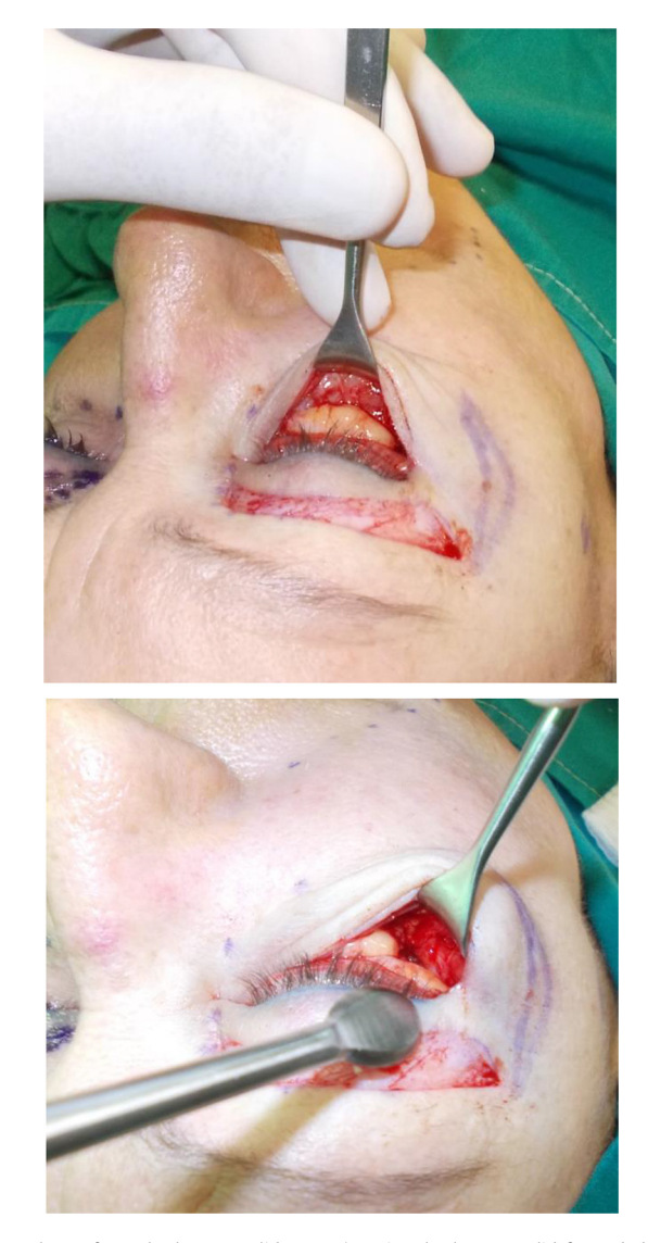
Fig. 1. Photos from the lower eyelid: upper) notice the lower eyelid fat pads before redraping and the inner canthus, lower) notice the rim of the concha before releasing it from the soft tissues with the dissector.

Blunt dissection to the periosteum of the infraorbital rim was performed to release the arcus marginalis and the dissection was extended laterally above the zygomatic bone—arch (Fig. 1). Special