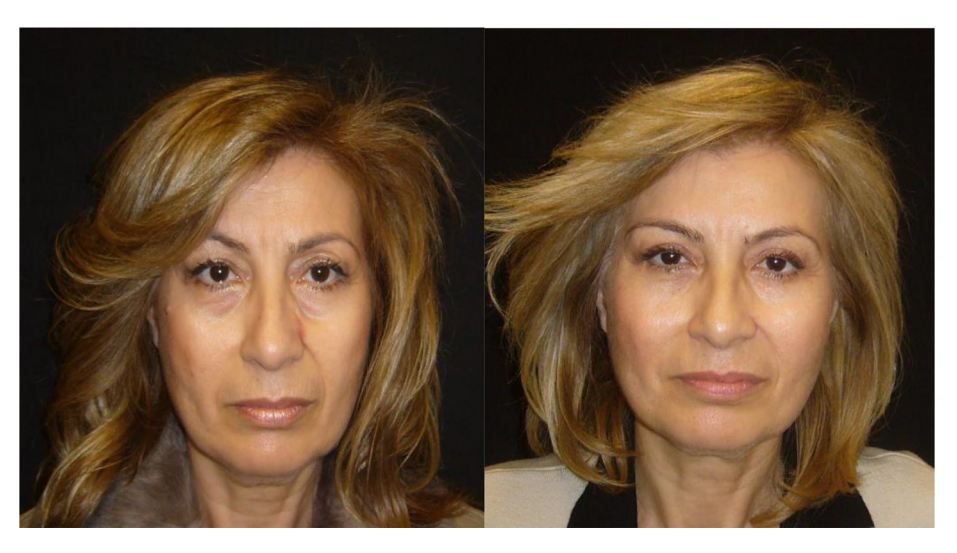
Fig. 5. Patient with tear trough deformity. Photos left) before and right) 1 year post operatively.

blepharoplasty was proposed by Hinderer et al. (1987). Hester et al. (2001) and Hester et al. (2000) were the first to correct malar bags through subciliary incision and suspension of the orbicularis muscle.